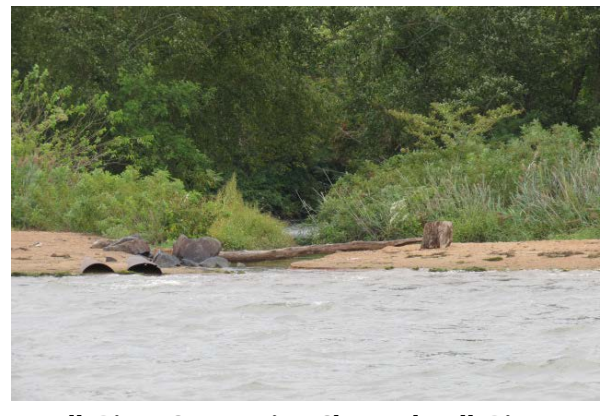
Elk River Connecting Channel – Elk River Outlet at High Tide