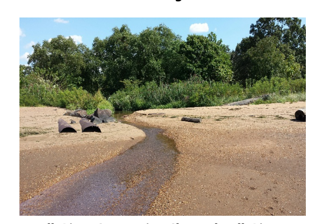
Elk River Connecting Channel – Elk River Outlet at Low Tide